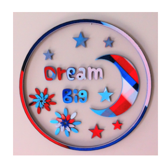
CHILDREN & TEENS 3D PRINTING By TOYSINBOX PEOPLE

The libraries offer these events free to the public. Please contact the individual libraries for registration.