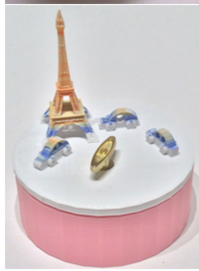
Happy Holidays and See You in 2016!